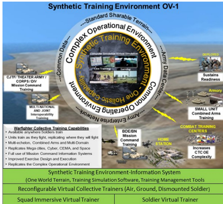
Figure 1-1. STE OV-1.

The U.S. Army's future training capability is the Synthetic Training Environment (STE). The STE will be a single, interconnected training system that provides a training environment, in which units from Soldier/Squad through Army Service Component Command (ASCC) conduct collective training, see Figure 1-1 below.